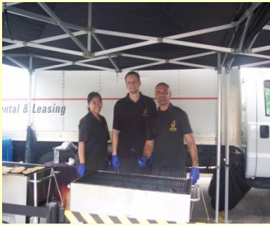
THE TEAM READY TO SERVE