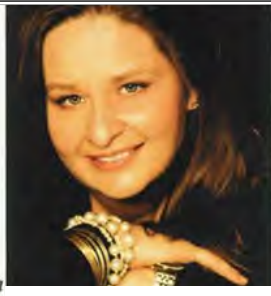
Owner Resident Essex II Your "Essex" Expert