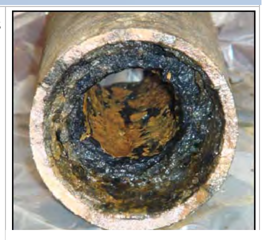
(Cross section of an actual Essex drain pipe)

Can you help to control the problem? Absolutely! Never wash food scraps down your sink. Always avoid pouring grease down the sink. Some grease can be cooled and discarded in your green bin or wiped up with a paper towel and put in your garbage.