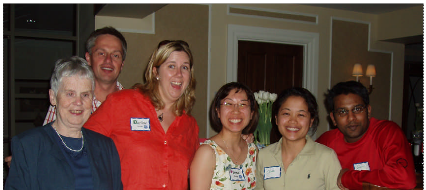
Cheers to the Social Committee organizers!!